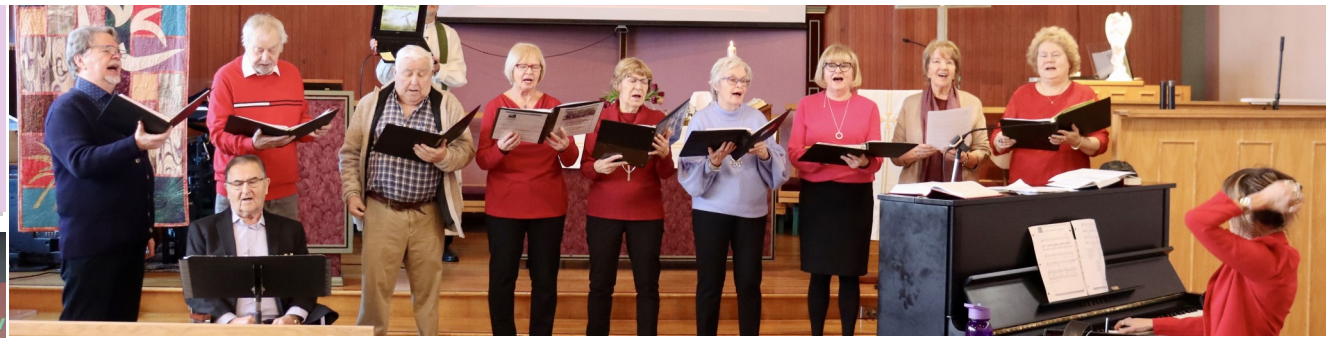
Ystävänäpäivän kirkko Emmauksessa 9.2. Celebrating Valentine's Day at Emmaus with the Choir!