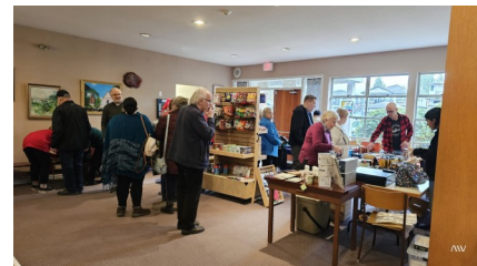
Thanks for the FinnGoods!