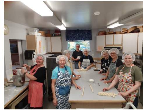
So many Pullas and Karelian Pastries were baked before Emmaus Bazaar!