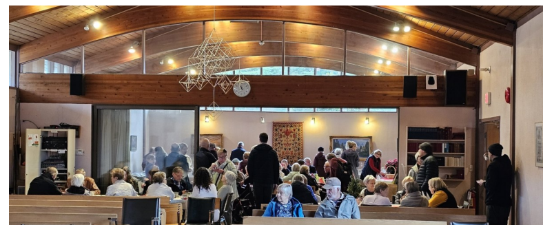
Emmaus Christmas Bazaar Nov 23. Kiitokset lahjoittajille!