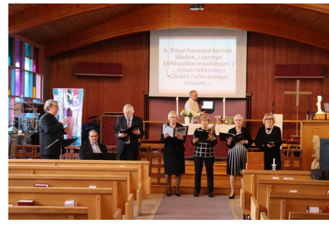
Pyhäinpäivän kynttilöiden sytytys poisnukkuneille. All Saints Day Service and Memorial Candles, November 3rd. Thank you for the Choir!